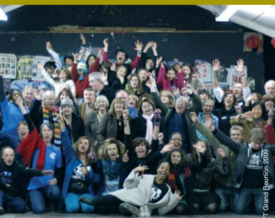
OYT Grand Reunion 2009

style: A platform of short science inspired performances min age: Any age weblink: www.pegasustheatre.org.uk