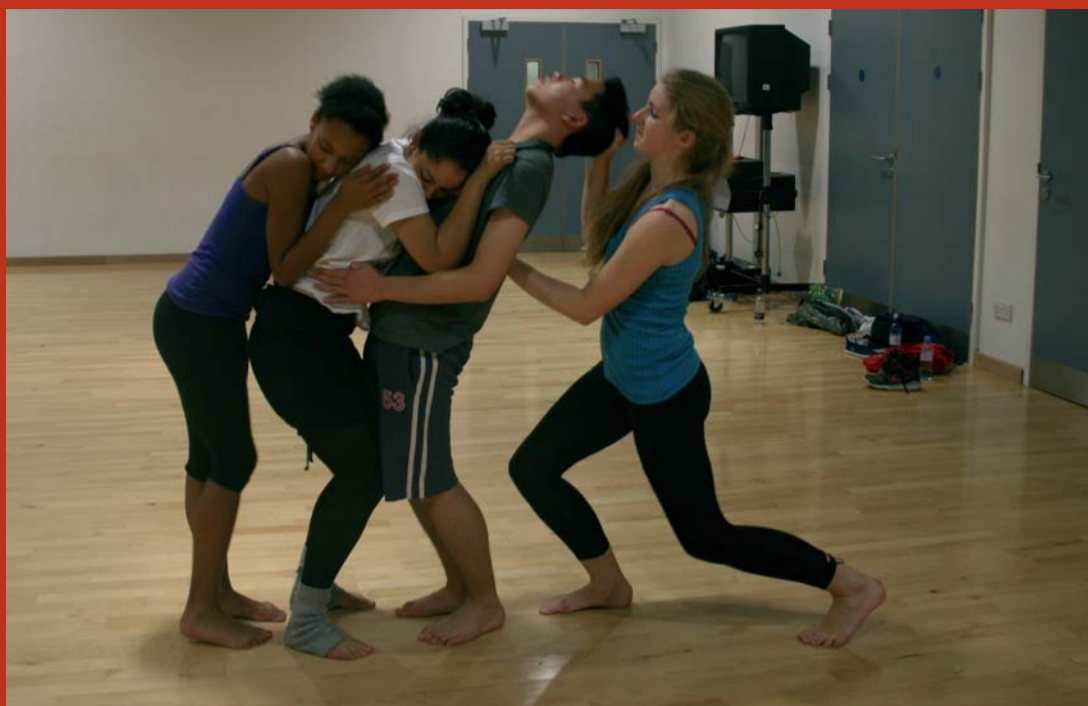
OYT Dance Company in rehearsal