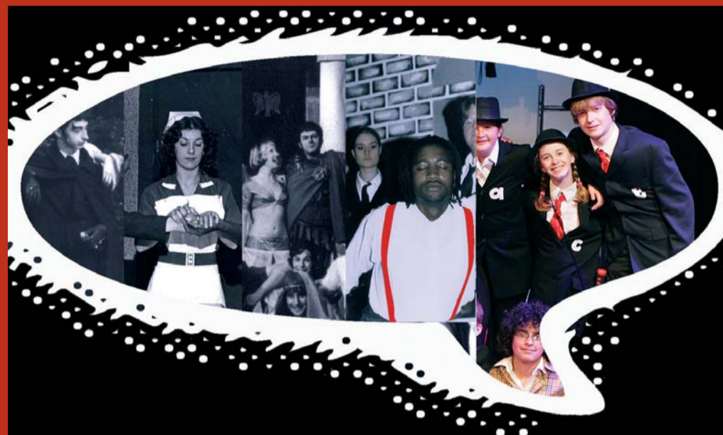
Images from past Oxford Youth Theatre productions

During the run of the exhibition the OYT Dance Company will present Walking On Eggshells , a performance that looks at the effects of family separation, on 6 February. This will be one of the few opportunities to see the company in action before they go on international tours in the summer of 2010.