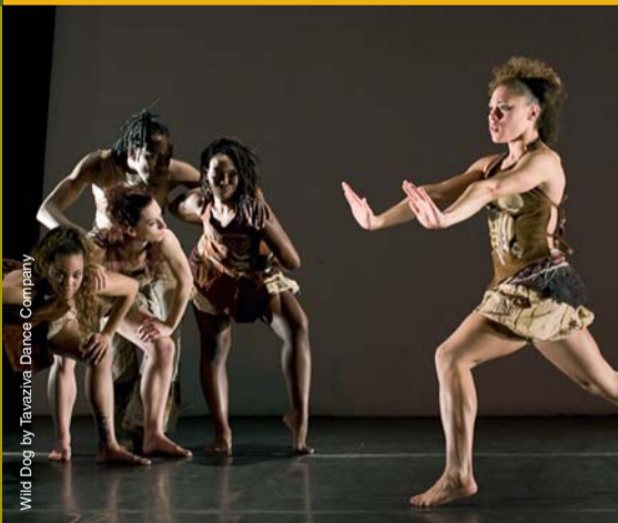
Wild Dog by Tavaziva Dance Company

style: Exhibition followed by informal celebration min age: age from 6 years upwards length: 2 1/2 hours weblink: www.pegasustheatre.org.uk