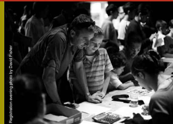
Registration evening

Glanville Road Oxford OX4 2AU Pegasus box office on 01865 792209 or online at www.pegasustheatre.org.uk